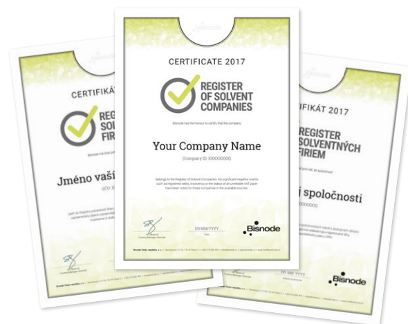
Samples of printed certificates