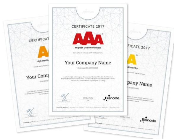
Samples of printed certificates