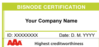
AAA, AA and A Rating Sample of the active logo designed for website use